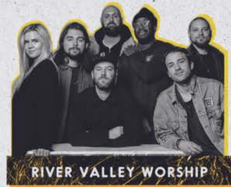
RIVER VALLEY WORSHIP