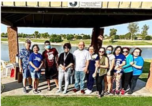
The new Filipino/American church plant in Tucson gathers for the first time!

A tsunami of God's presence is striking these people groups who have found a home in the state of Arizona. With great sacrificial efforts of Spirit-empowered pastors, these amazing churches are living out the Great Commission to "go and make disciples of all nations". Please pray for these leaders who are 'missionaries' in this land to reach their people. Pray for these churches who are starting to plant daughter churches. Pray for the birthing of four new church plants. Pray that God will send more laborers. With prayer and the miraculous power of the Holy Spirit "we can see God do exceedingly above all we could ask, think or imagine."