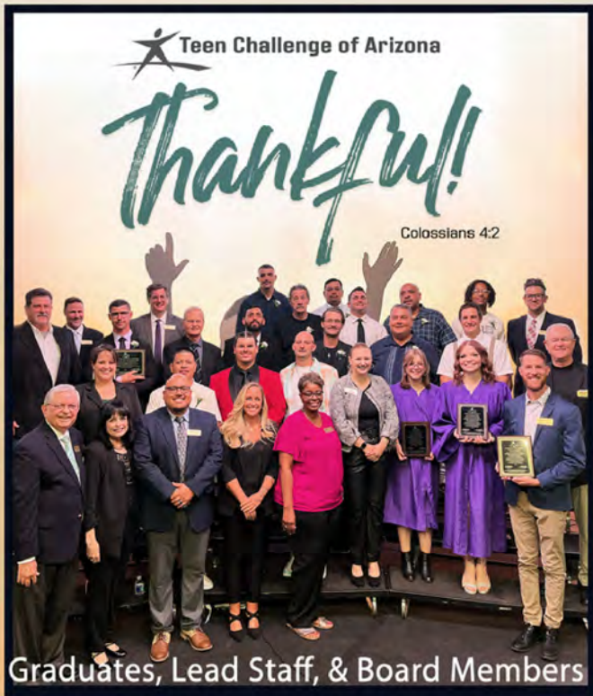
Graduates, Lead Staff, & Board Members