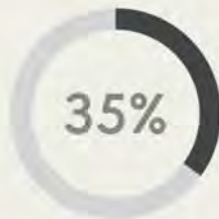
Churches with an ASOM student

38 of the 61 newly credentialed ministers at 2023 Network Conference took ASOM classes