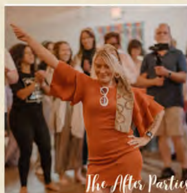
The After Parties