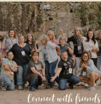
Connect with friends