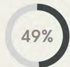
Male : Female

About 58% of our registrants were under 40, with about 36% being under the age of 30