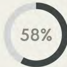
Under the Age of 40

About 35% of AZAG churches have at least one student taking classes